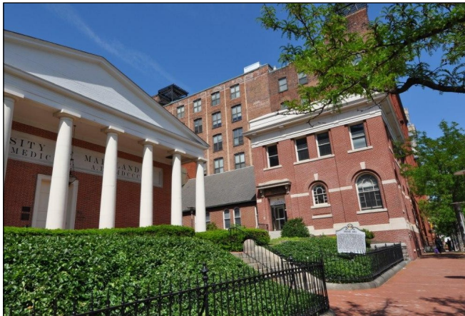
East Hall (shown here (R) next to the historic Davidge Hall) was officially “opened” at the 20th Anniversary & Ribbon Cutting Ceremony on May 17, 2011.